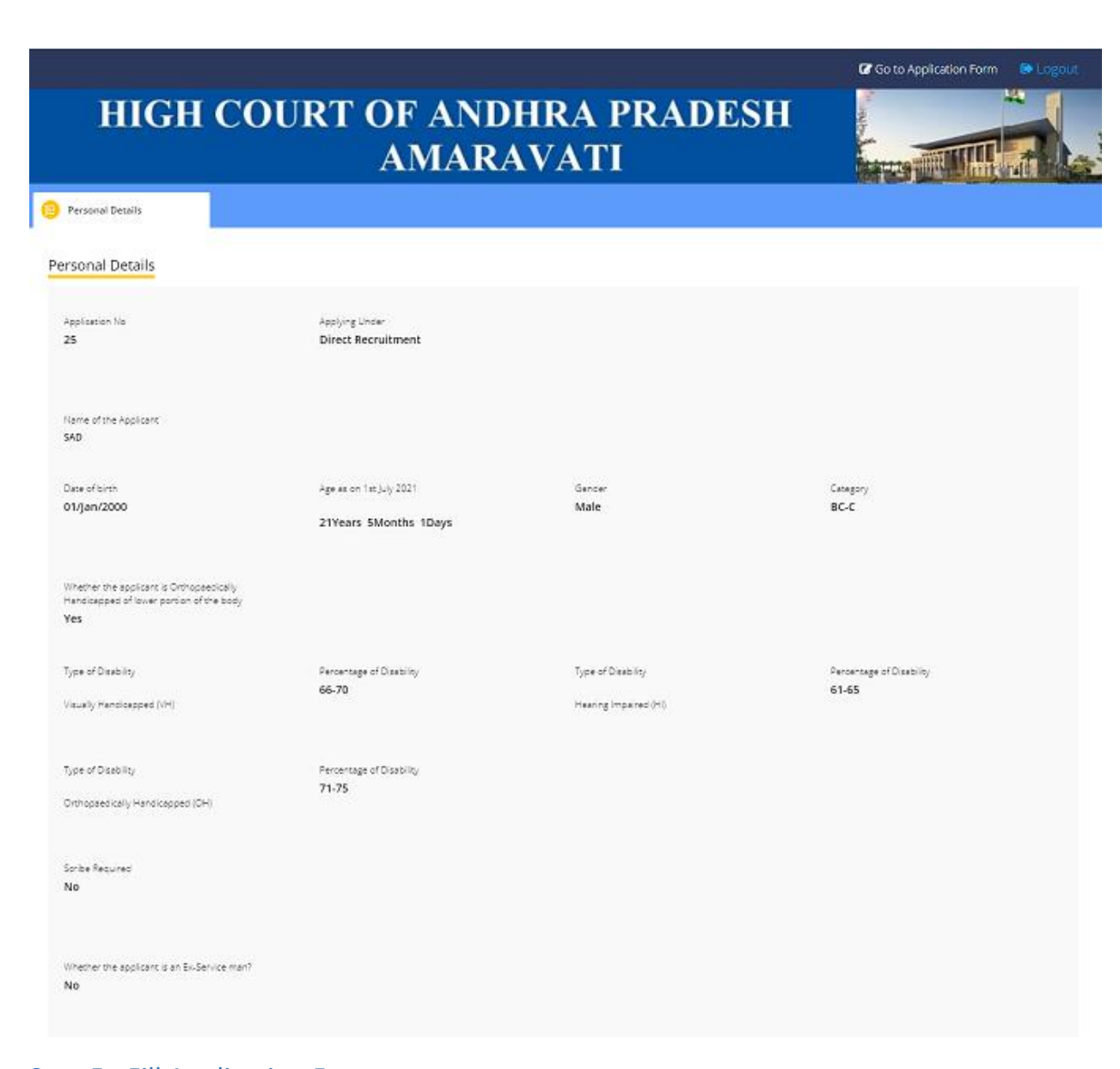
Step 5 - Fill Application Form

The Application Form is categorized into the following four sections: